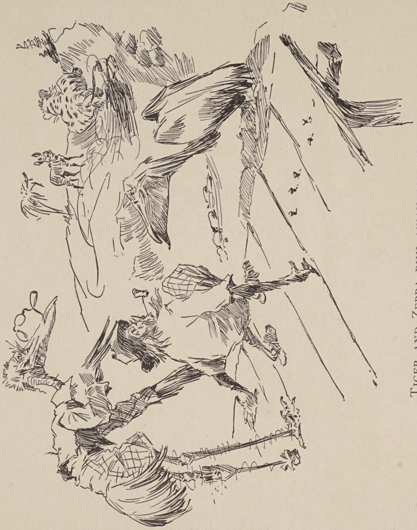
TIGER AND ZEBRA RUN AWAY ASHAMED.